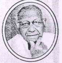
Swatantra Senani Uttamraoji Pa